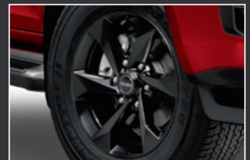
17" GLOSSY BLACK ALLOY WHEELS