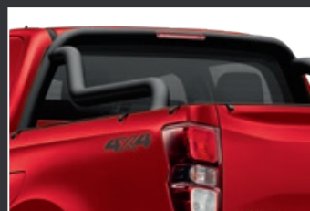
BLACK SPORTS BAR & SOFT TONNEAU COVER