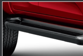
DARK GREY SIDE STEPS