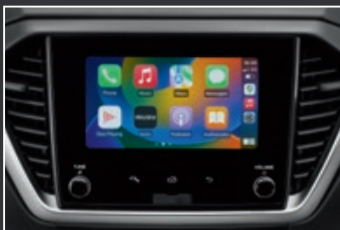
8" TOUCHSCREEN WITH APPLE CARPLAY® & ANDROID AUTO™

Whether you're ruling off-road or roaming the city, the Isuzu D-MAX X-RIDER combines a signature toughness with sleek styling that allows you to stand out from the crowd. Equipped with a Black Sports Bar, redefined Front Grille, 17" Glossy Black Alloy Wheels and a Soft Tonneau cover. Plus, with the legendary Isuzu 3-litre turbo-diesel engine, 3.5t towing capacity*, 5-Star ANCAP safety, 4x4 Terrain Command as well as features such as Rough Terrain Mode, wireless Apple CarPlay® and wireless Android Auto™, the Isuzu D-MAX X-RIDER is your ultimate travelling companion.