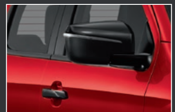
BASALT BLACK HANDLES & MIRRORS