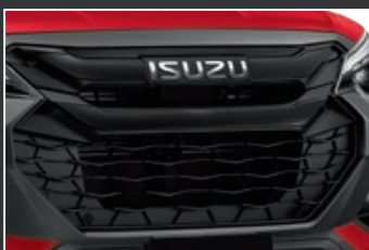
TWO-TONE BLACK FRONT GRILLE