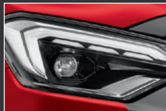
BI-LED HEADLIGHT WITH AUTO LEVELLING